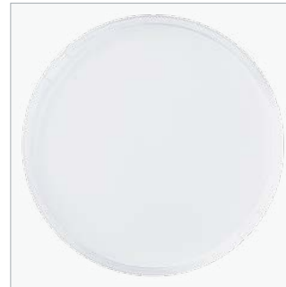
Struers OP-U NonDry.