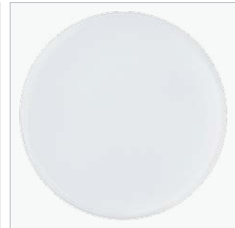
Struers OP-S NonDry.