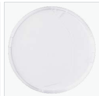
Competitor 2, non crystallizing oxide susp.