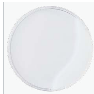
Competitor 1, non crystallizing oxide susp.