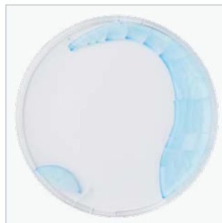
Competitor 1, regular oxide susp.