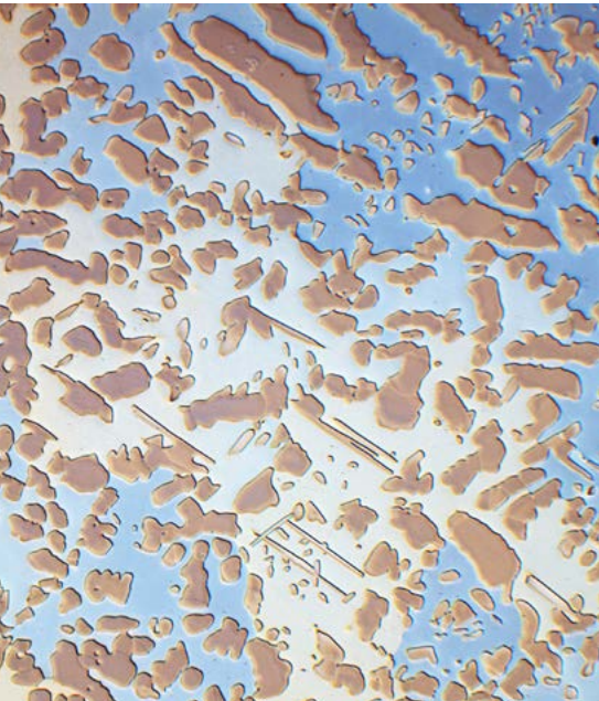
Duplex stainless steel, etched electrolytically using 40% aqueous sodium hydroxide solution. Differential Interference Contrast, 100x.

Boost polishing efficiency and ensure deformation-free results with Struers' complete line of active oxide polishing suspensions developed to meet your unique requirements for a perfect surface finish – fast.