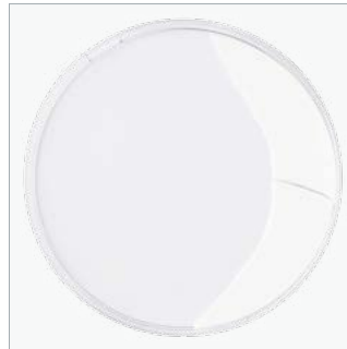
Struers regular OP-S.